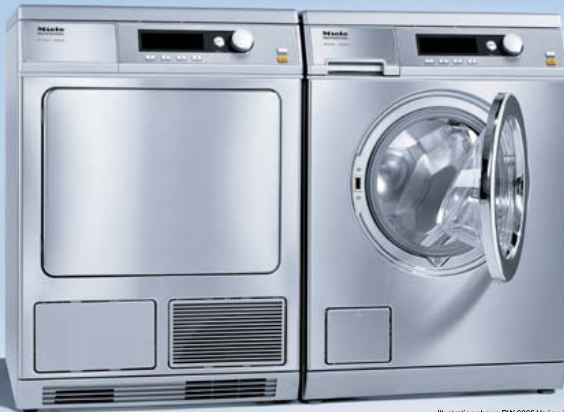
Illustration shows PW 6065 Vario with PT 7135 C Vario