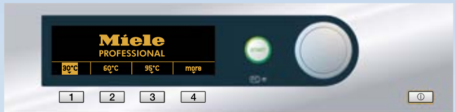
Programme selection concept: Direct-access buttons and more

Illustration shows Profitronic L Vario controls from the Octoplus range