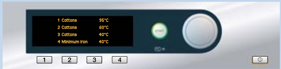
Programme selection concept: Direct-access buttons