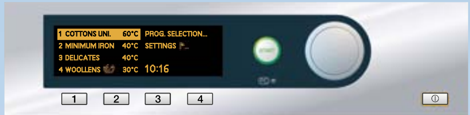
Programme selection concept: Standard