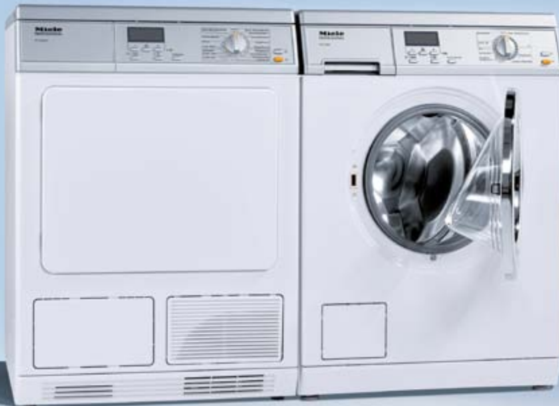
Illustration shows PW 5062 with PT 5135 C